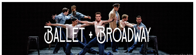
BALLET + BROADWAY