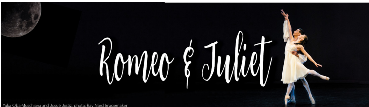
Romeo & Juliet